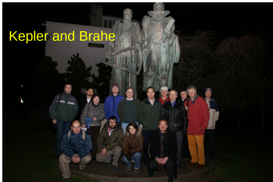
Kepler and Brahe