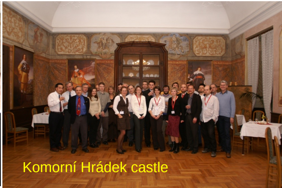
Komorní Hrádek castle