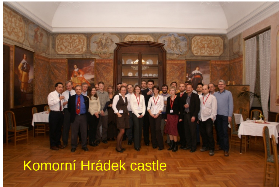
Komorní Hrádek castle