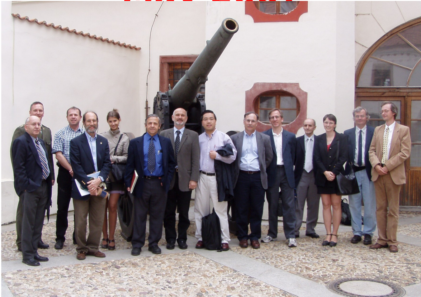
Visit to Komorní Hrádek Chateau